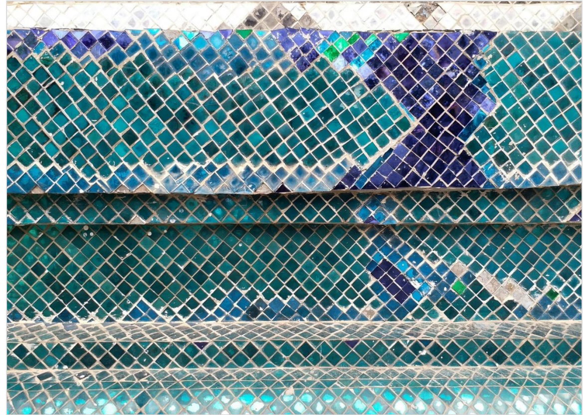
The Town of Luang Prabang World Heritage Site, Laos