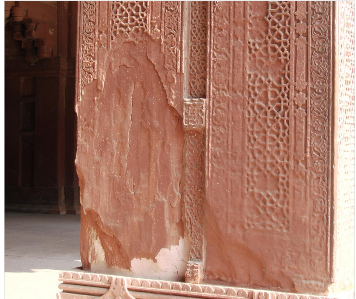
Agra Fort World Heritage Site, India