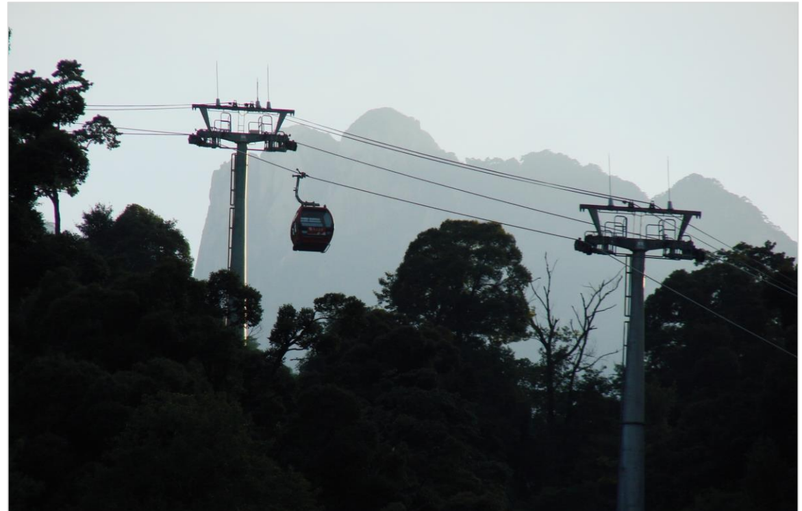
Sanqingshan World Heritage Site, China