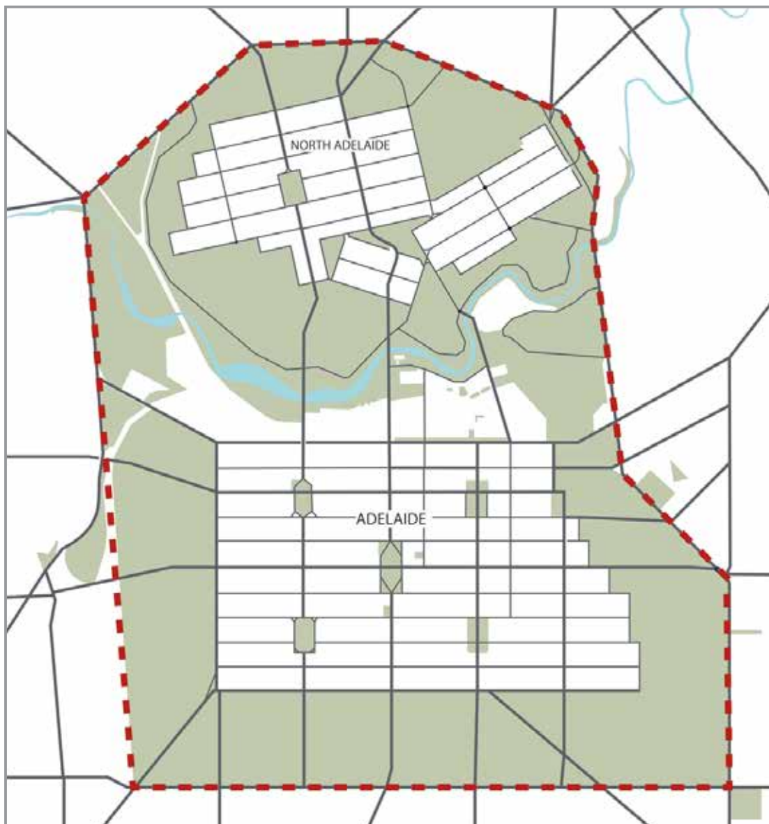
CITY OF ADELAIDE STUDY AREA (INSIDE DOTTED LINES)

When answering the questions, please only think about your current visit to The City of Adelaide area as indicated on the map. Thank you for sparing the time to complete the survey.