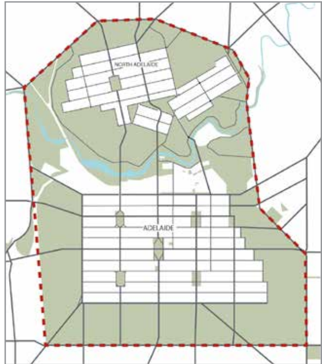
MAP 1: STUDY AREA CITY OF ADELAIDE

The study area was the City of Adelaide Local Government Boundary (Map 1)